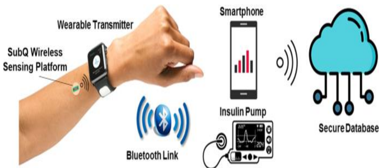
Figure: Showing wireless implanted monitoring device connected to a smart device and reciprocating implanted insulin pump to deliver precise insulin amounts. All are securely operated on a cloud database. [8]

Management of Type 1 diabetes must start with prevention, early diagnosis, and interventions. Autoantibodies to islet cells can be detected early on using simple assays. In unclear diagnosis, the C peptide test is used to evaluate beta cell function in suspected diabetics and it also helps to differentiate between type 1 and type 2 diabetes mellitus. [7]